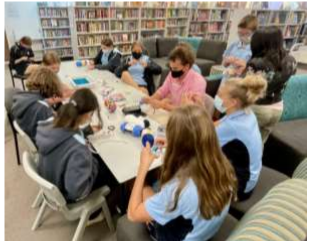
Staff and student's crafting wrist bands in the library by braiding, knotting and wrapping.