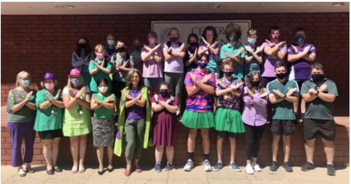
Collectively we can all #BreakTheBias .